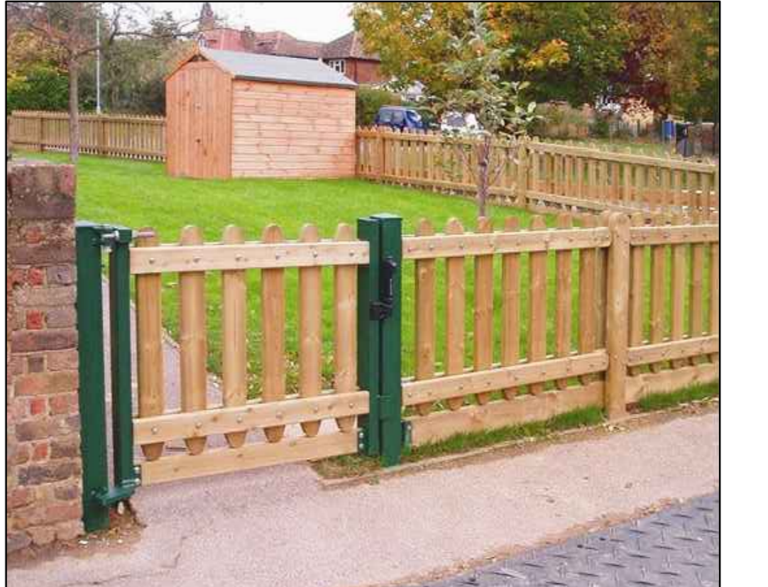
Wooden Playground Fencing and 2x Steel Framed Gates with self closing hinges, galvanised. Fence height to be a minimum of 1m high. Fences to be constructed and erected in accordance with the appropriate part of BS 1722. Timber to be of a natural finish, and steel framing of gates to be in colour green finish. Playtime Timber Fencing by Jacksons Fencing is suggested or similar approved.