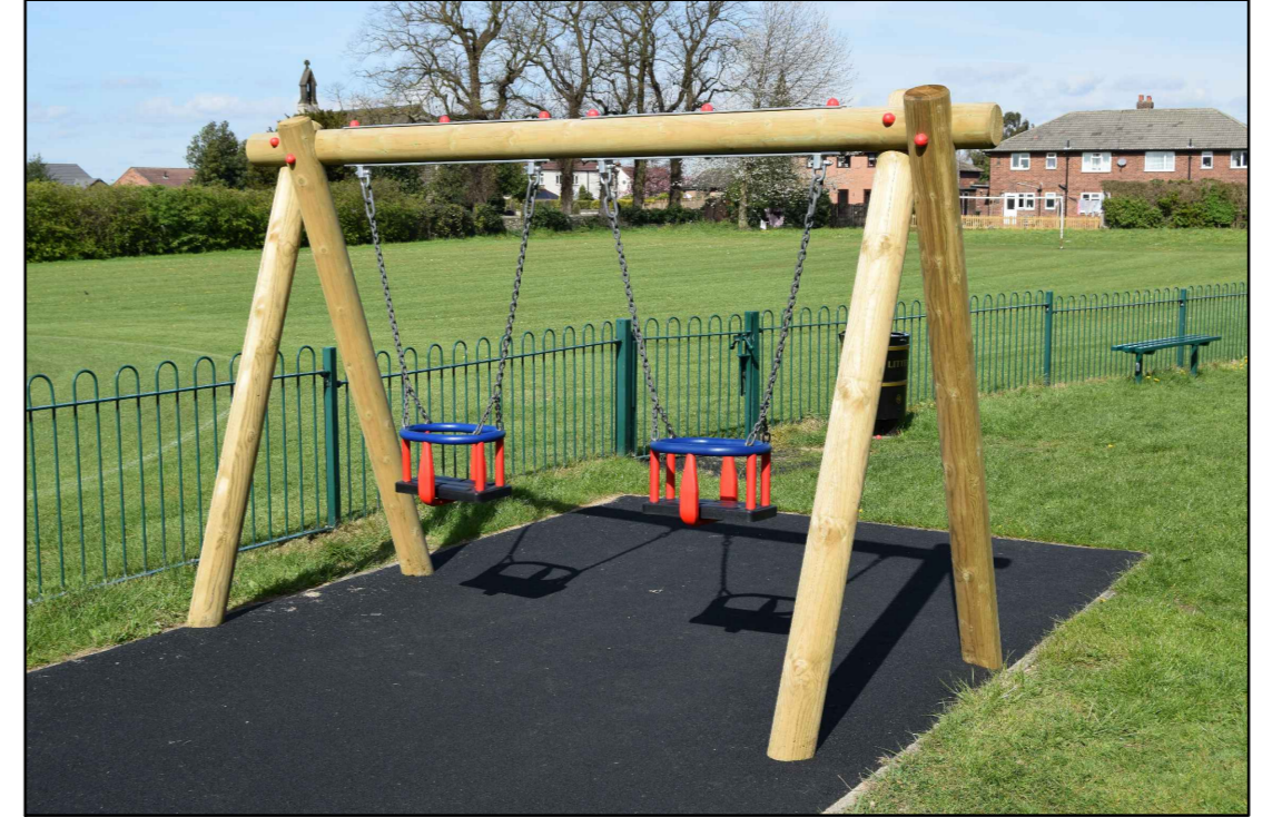
Timber Toddler Swing 1.8m high with steel ground fixings (ST18-2 by Streetscape or similar approved). Suitable for 1 to 4 year olds.