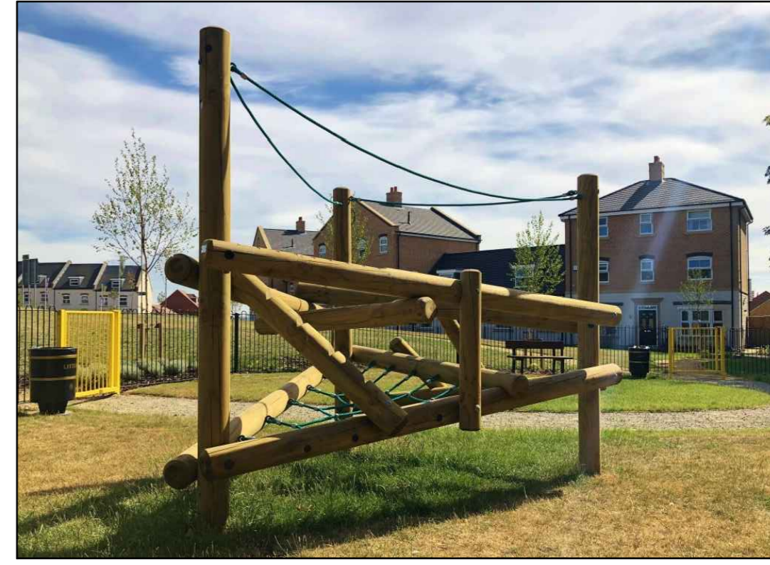
Small Timber Climber (Chopstix3 by Streetscape or similar approved). Suitable for 5 to 12 year olds. Promotes climbing and encourages unstructured play. Made from timber with netting and rope.