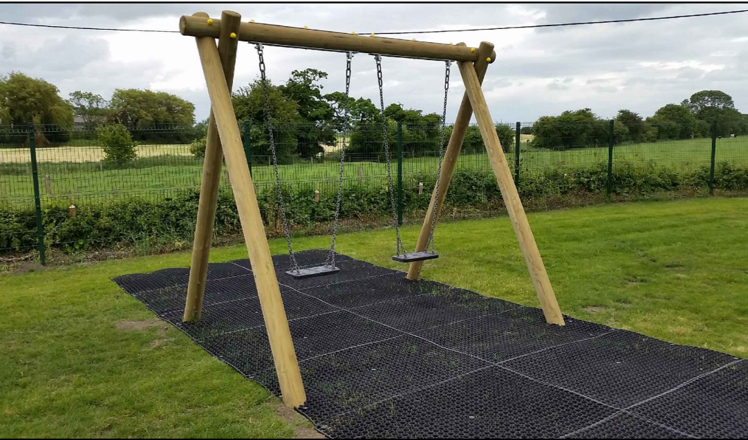
Timber Junior Swing 2.4m high with steel ground fixings (ST24-2 by Streetscape or similar approved). Suitable for 4 years plus.