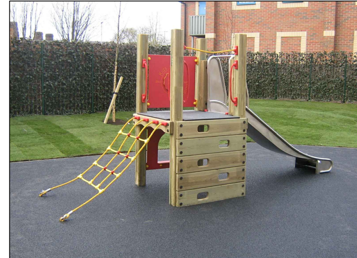
Ash Multiplay Unit with Side and Climbing Net (MPFT1 by Streetscape or similar approved). Suitable for 2 to 12 year olds. Tower is made from Safalog which is a laminated, natural, and split and crack resistant timber. H:1000mm high.