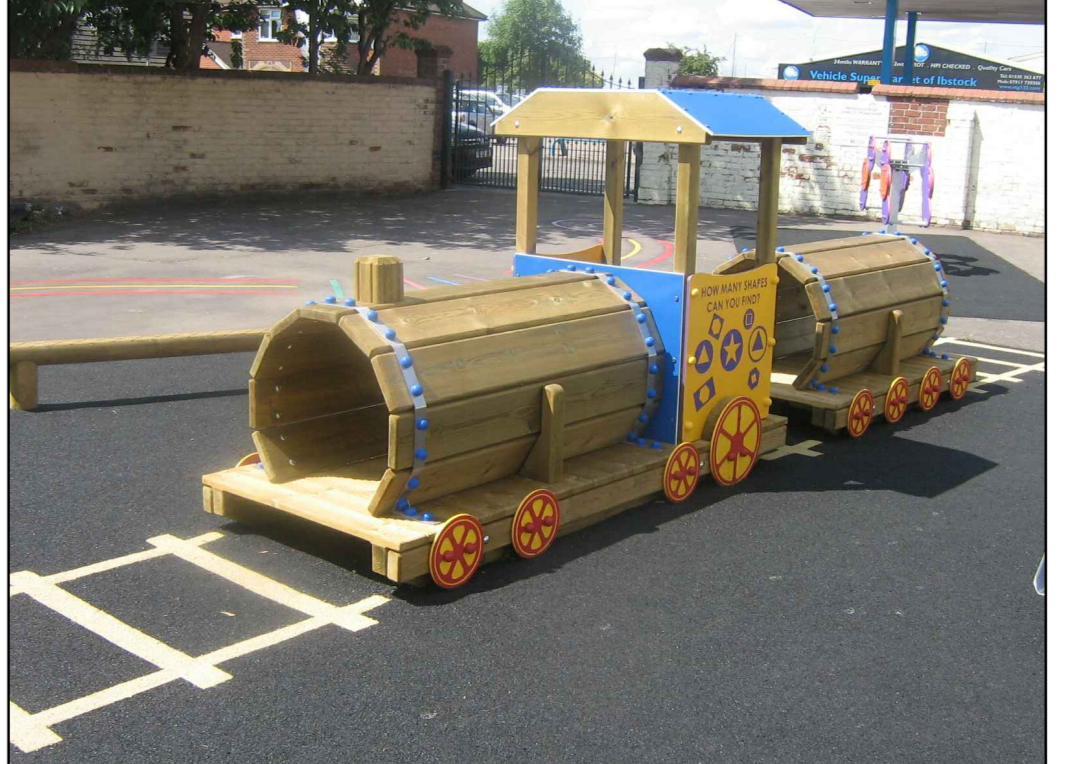
Play Train (NB17 by Streetscape or similar approved). Suitable for 2 to 7 year olds. Made from timber.