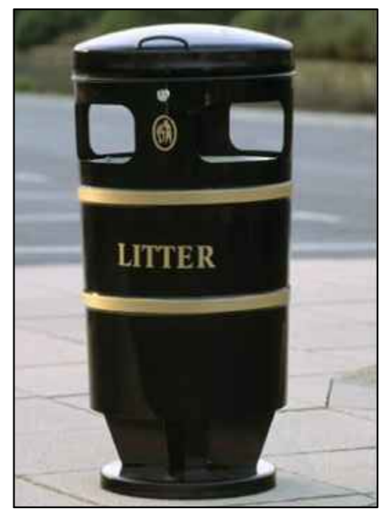
1 x Imperial litter bin (90 litre capacity with lid, lock, and liner. Colour black with gold detail) (LBI by Streetscape or similar approved).

DO NOT SCALE ALL COORDINATES RELATED TO LOCAL GRID LOCATED TO OS NG BY BEST FIT TO DETAIL, EXTRACTED FROM OS DIGITAL DATA. © This drawing, including the design and technical information contained on it, is the property of Ascerta. The drawing may only be used for the specific purpose for which it has been intended and may not be reproduced or copied without prior permission.