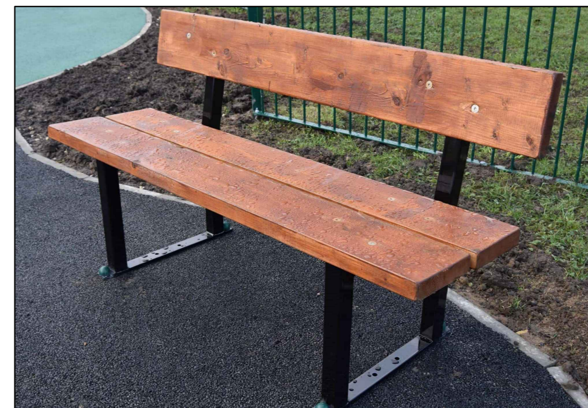
2 x Norton Steel and Timber Seat with Back (SNTS by Streetscape or similar approved). 1500mm long.