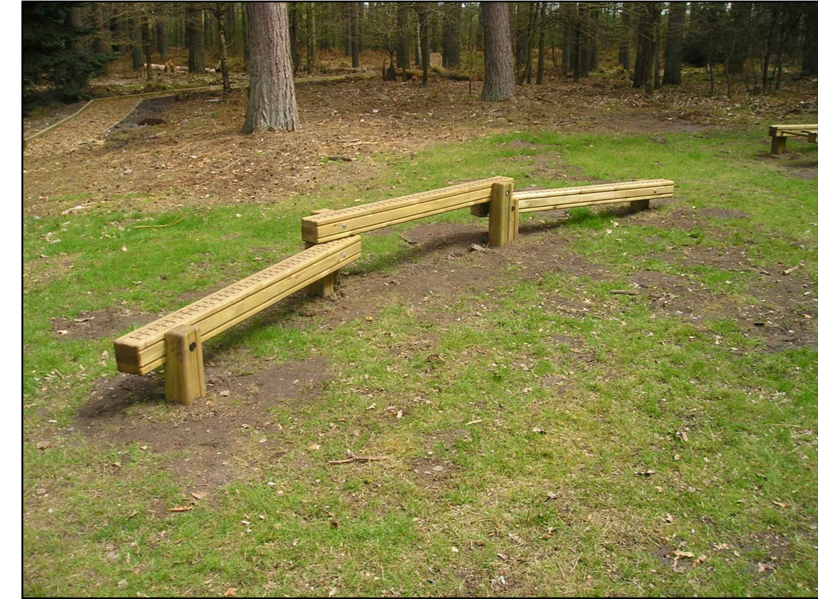
Triple Balance Beams (TT2 by Streetscape or similar approved). Made from timber.