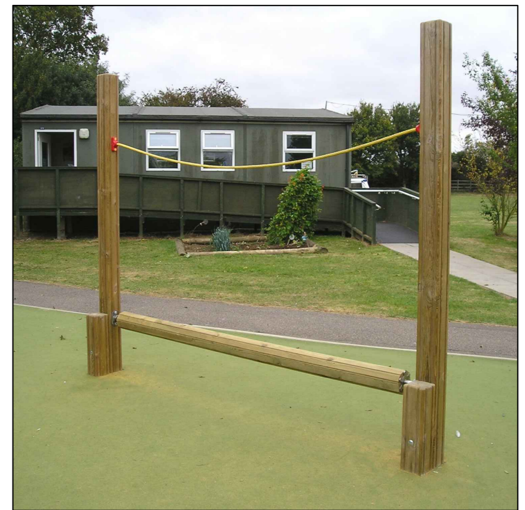
Rolling Log (TT19 by Streetscape or similar approved). Made from timber with steel components.